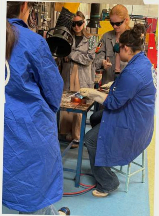
Welding in Nîmes